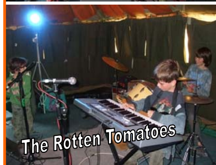
The Rotten Tomatoes